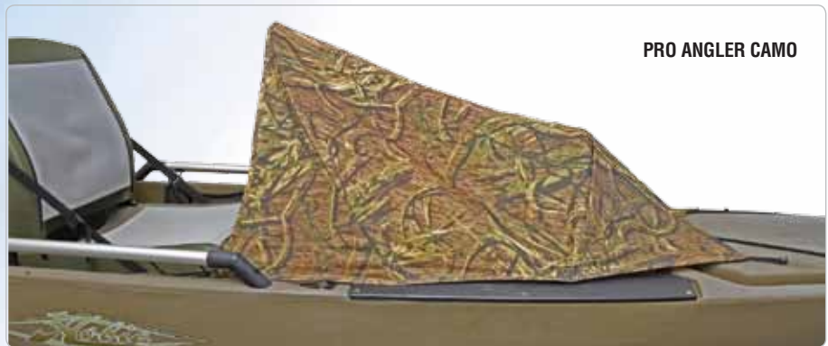
PRO ANGLER CAMO