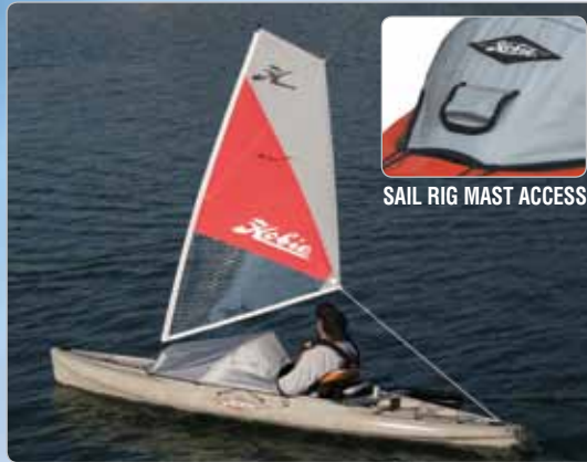
SAIL RIG MAST ACCESS