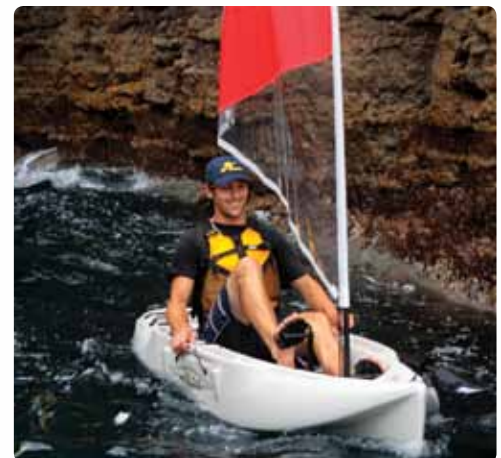
For top sailing performance, add the ST TURBO fin kit and larger rudder!