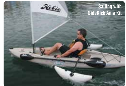
Sailing with SideKick Ama Kit