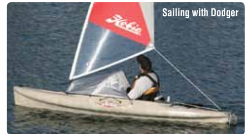
Sailing with Dodger

Requires slight modification for use on i-Series, Quest