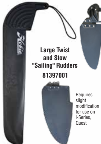
Large Twist and Stow "Sailing" Rudders 81397001

Requires slight modification for use on i-Series, Quest