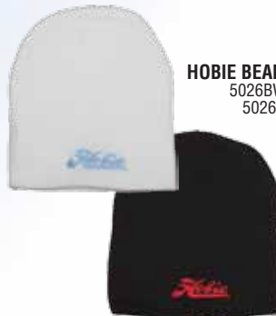
HOBIE BEANIE $19.99 5026BW (Women's White) 5026BM (Men's Black)