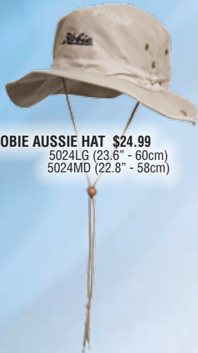
HOBIE AUSSIE HAT $24.99 5024LG (23.6" - 60cm) 5024MD (22.8" - 58cm)