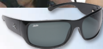
1565BLK - Escondido $70.00