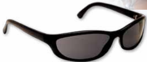
1562BLK - PLAYA $70.00