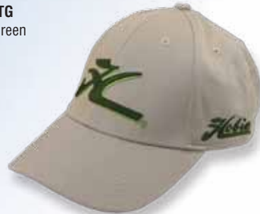
5018TG Tan Green