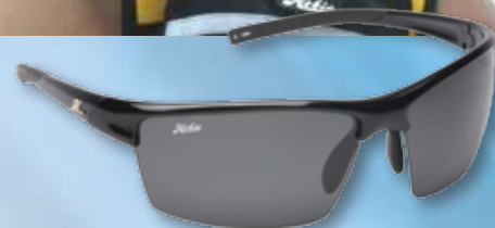
1564BLK - Boomer $70.00