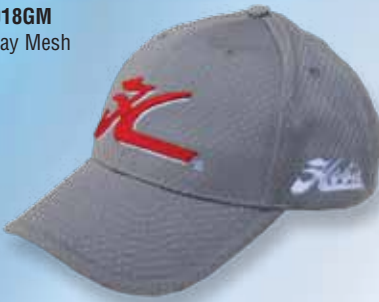
5018GM Gray Mesh