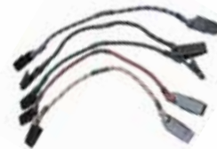
LID LATCH Don't let that fancy new hat blow away. Secure it to your shirt, life vest, or harness with a Lid Latch. 1553L $4.99