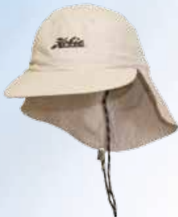
HOBIE MICROFIBER HAT WITH NECK FLAP $24.99 5025MF