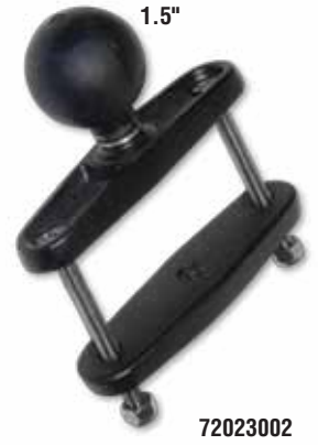
72023002 RAM SPACE SAVER (1.5")