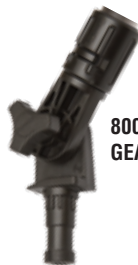
80048006 GEAR HEAD MOUNT