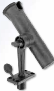
72023022 RAM TUBE (PLASTIC) PIVOT ROD HOLDER W/ FLUSH MOUNT