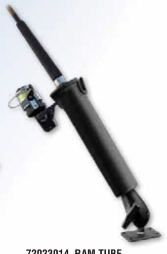
72023014 RAM TUBE (PLASTIC) ROD HOLDER (1.5")