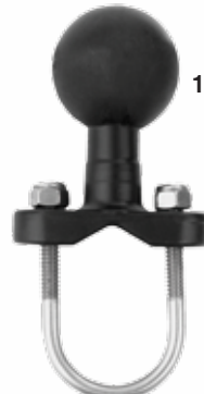
72023025 U-BOLT 1-1.25" RAIL BASE W/ 1.5" BALL