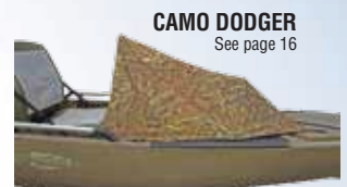
CAMO DODGER See page 16

Revised mount hardware to fit Pro Angler Rails 4/2012