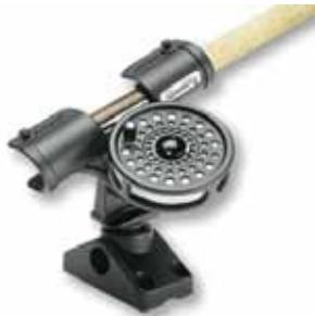
80055001 FLY ROD HOLDER WITH DECK / SIDE MOUNT