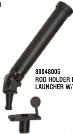
80048005 ROD HOLDER ROCKET LAUNCHER W/FLUSH MOUNT