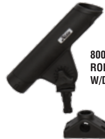
80048004 ROD HOLDER W/DECK / SIDE MOUNT