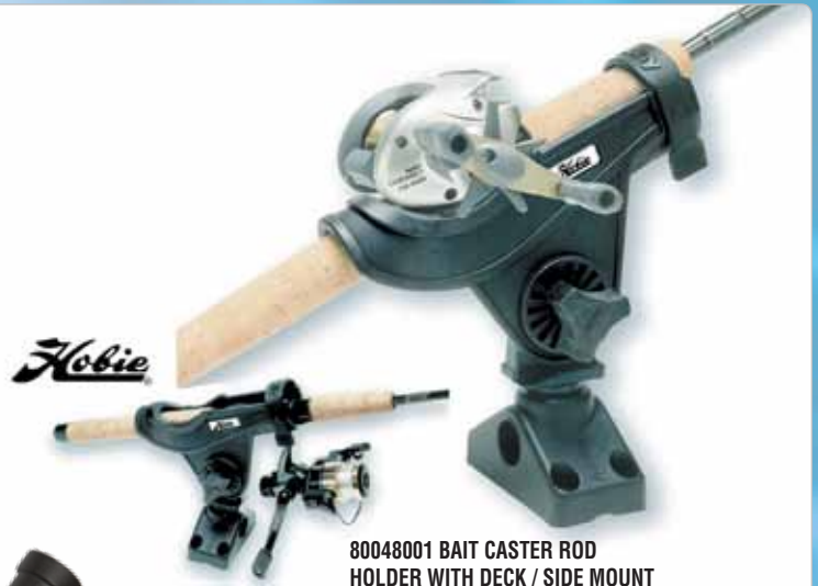
80048001 BAIT CASTER ROD HOLDER WITH DECK / SIDE MOUNT