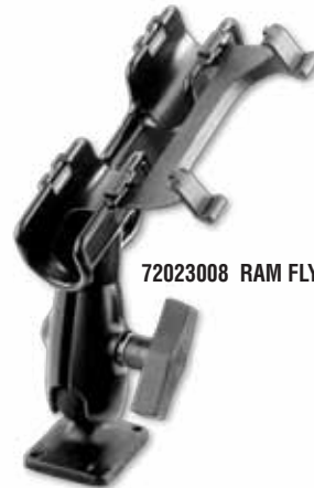
72023008 RAM FLY ROD HOLDER (1.5")