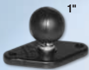
72023001 RAM SMALL DIAMOND (1")