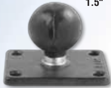
72023003 RAM 2 X 2.5 (1.5")