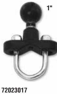
72023017 U-BOLT .5-1.25" RAIL BASE W/ 1" BALL