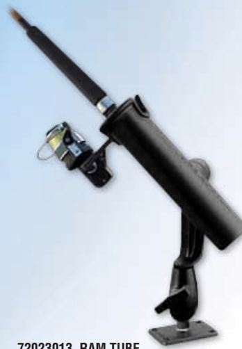
72023013 RAM TUBE (PLASTIC) PIVOT ROD HOLDER (1.5")