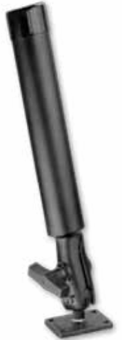
72023000 RAM TUBE (ALUMINUM) ROD HOLDER W/ 72023003 BASE (1.5")