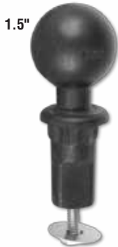
72023004 RAM POST SCOTTY CONVERSION (1.5")