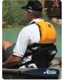
BACK FLOTATION ABOVE SEAT BACK

S6143-4-5 Sizes (Chest): SMD 30" - 42" LXL 42" - 52" / UNIVERSAL 30" - 54"