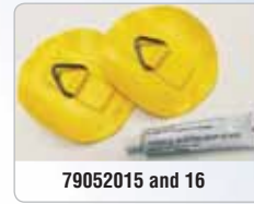
79052015 and 16