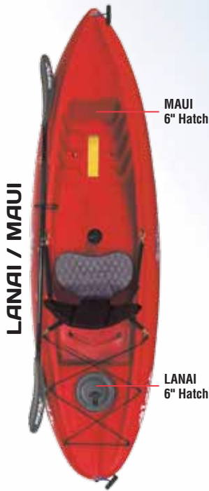
MAUI 6" Hatch