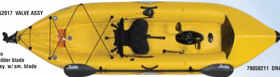
76050001 Bow/ Stern handle