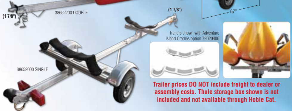
Trailers shown with Adventure Island Cradles option 72020400

These trailers are versatile platforms that can be used for any kayaks. Order the basic single or double trailer to carry one or more kayaks inverted on the crossbars (crossbar padding / cradles are not included in trailer pricing). For the Adventure Island, Tandem Island or Pro Angler, add the optional custom designed hull cradle sets. These are form fitted and foam covered. Strap down your Adventure Island with the custom tie down set. For two Adventure Islands, order the double trailer (Double-Double for two Tandem Islands) add two cradle sets and the center Tower System. The Tower includes mast / sail hangers and is also designed to mount an equipment box on top (Does not include box shown). Easily mount the Hobie Toy Box on top of the Tower (Thule box shown). Trailers ride on 8" wheels and use a 1 7/8" coupler.